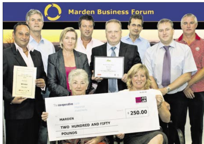
Members of the Marden Business Forum with the winning cheque and certificates

"Marden Business Forum we feel is unique, incredibly useful and successful to businesses in difficult times."